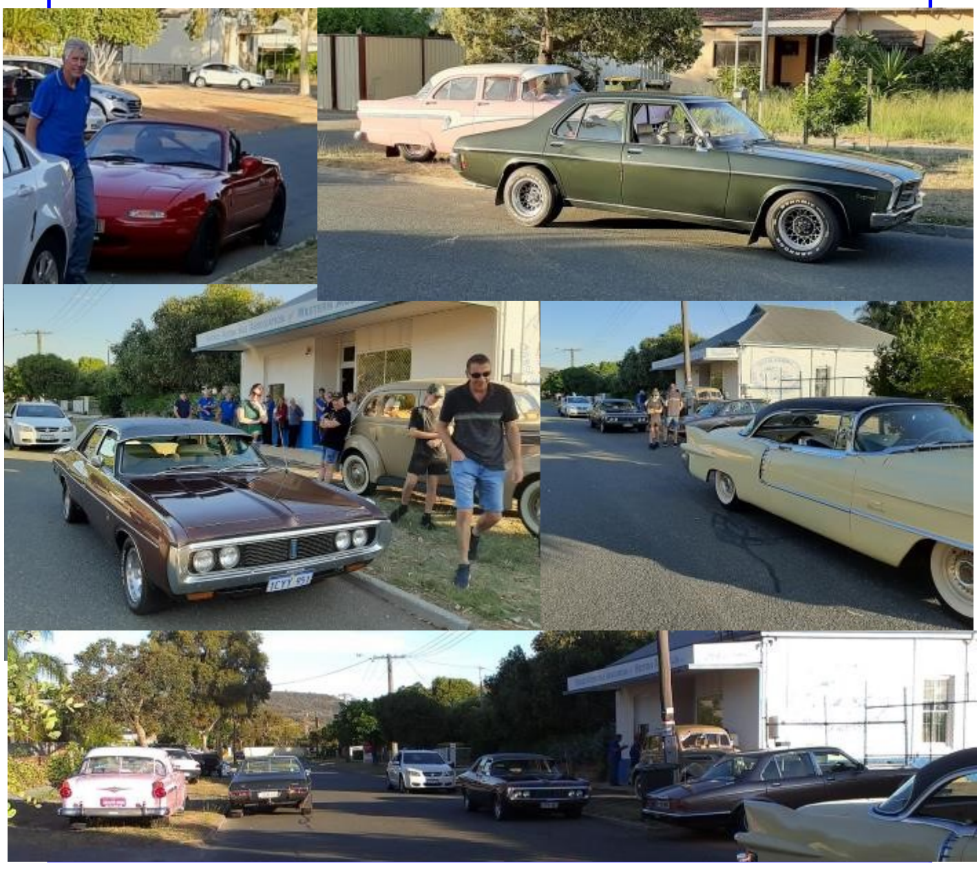
Starting out on the Captain Munchies drive to Fremantle